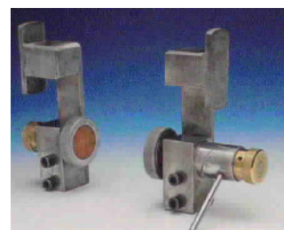
Mini Jig Accessories For Small Components